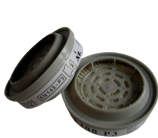
Advantage 200 Particle Filter P3