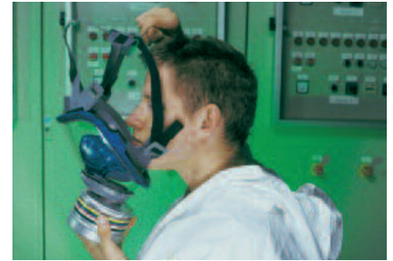
Put your chin into the chin cup