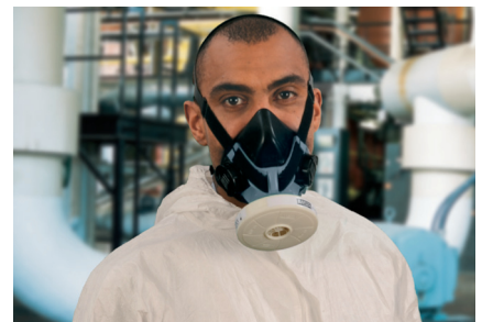
Advantage 410 with P3 PlexTec filter

For detailed information on standard thread filters please see leaflet 05-100.2.