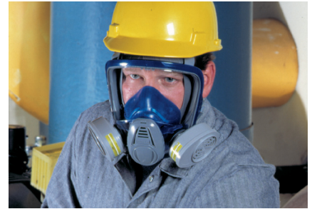
Advantage 3200 with Advantage chemical cartridges

The Advantage filter lines are for use with Advantage 3200, Advantage 200 LS and Advantage 420.