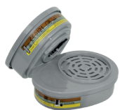
Advantage 201 Chemical Filter A2B2E1