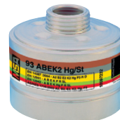
Combination Filter 93 ABEK2-Hg/St