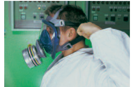
Tighten the two lower straps

The full face mask series Advantage 3000 provides both protection and unparalleled comfort. The soft sealing line made of hypo allergenic silicone provides a pressure-free fit. The large, optically corrected lens ensures a clear, undistorted view, while the grey-blue colour gives the mask an aesthetic appearance.