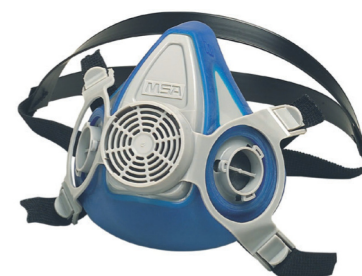
Advantage 200LS half mask

The Advantage 200 LS is a comfortable, efficient and economic half mask. It is ideal for applications where workers are exposed to various hazards from job to job, such as high concentrations of fumes, mists and gases.