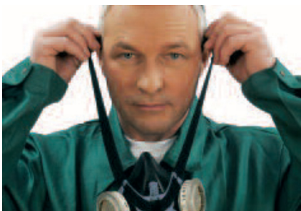
Place cradle on head