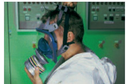
Pull the harness over your head