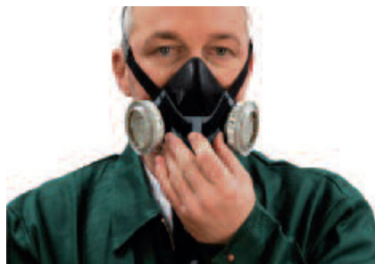
Pull down front straps and lock lever