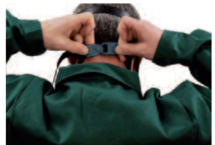
Close neck buckles and pull on both straps evenly