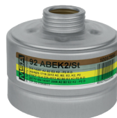
Combination Filter 92 ABEK2