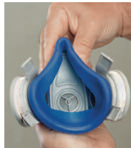
Facepiece-to face Anthrocurve