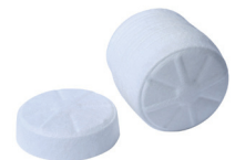
Pre-Filter for Filter Cartridge